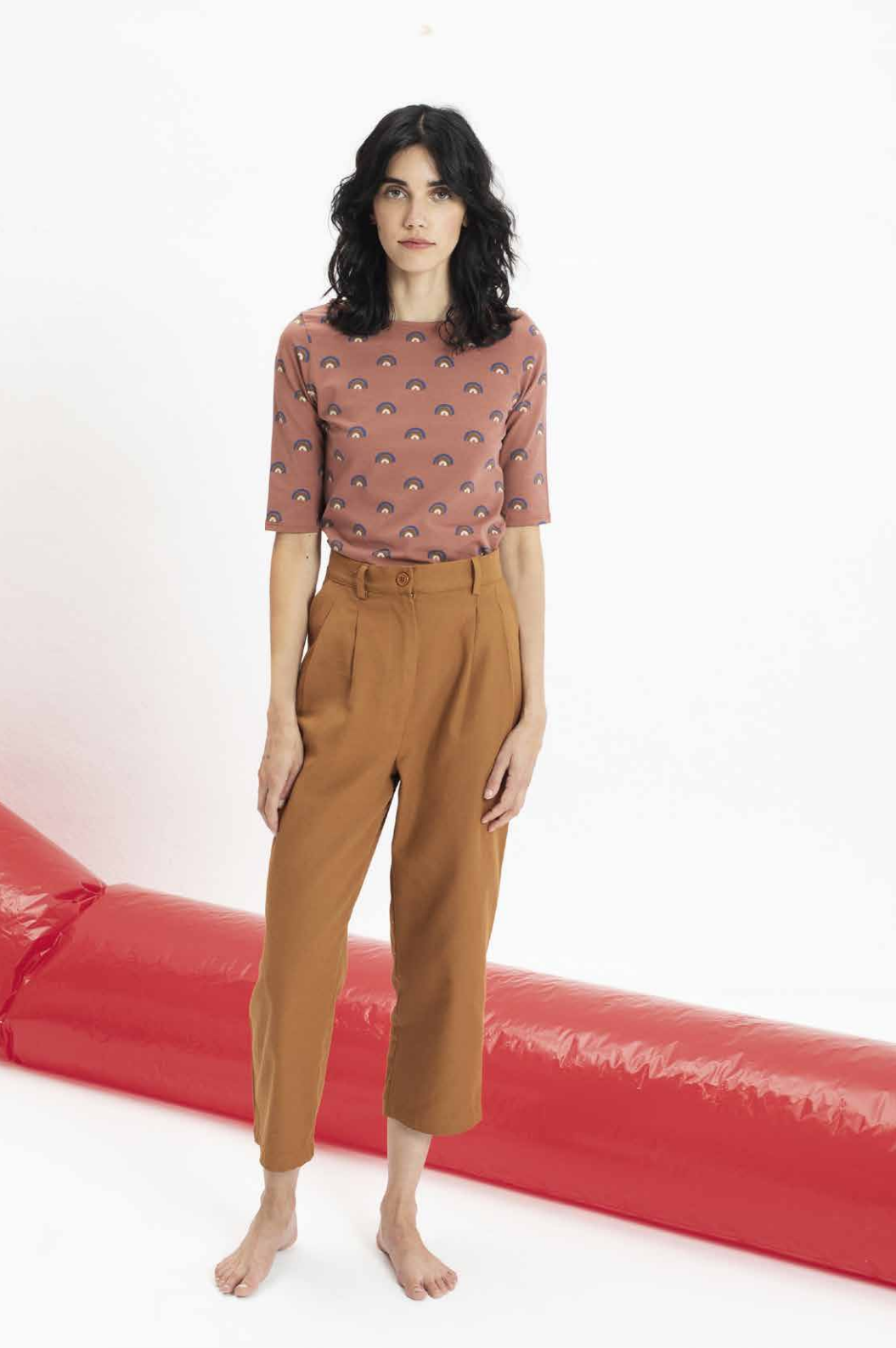
Camiseta UMAK + Pantalón MONTY