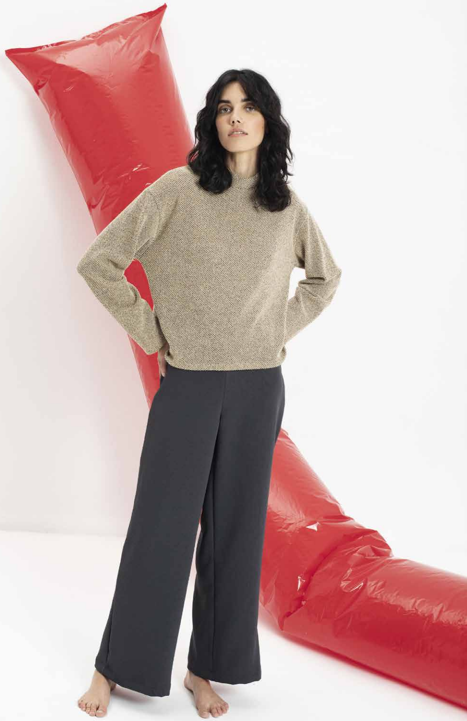
jersey VANNA + Pantalón PLUM